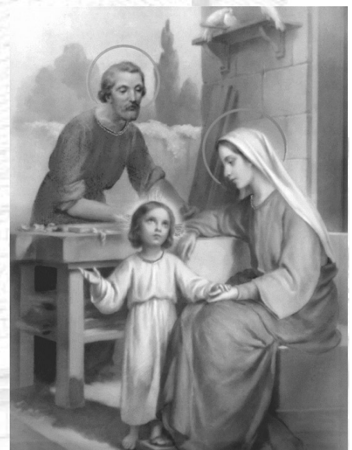
"The Family That Prays Together Stays Together" - Fr. Patrick Peyton, CSC